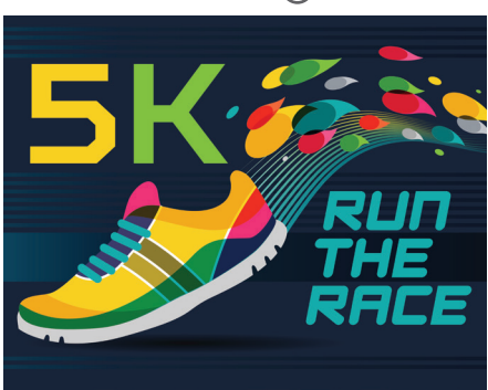
JUNE & JULY—CONFIDENCE